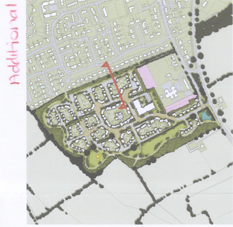
LOCATION PLAN: TYPICAL SECTION